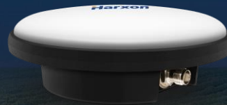
Ruggedized GNSS Antenna