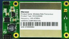
Dual-Band Radio Modems