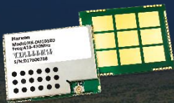
UHF Radio Modems