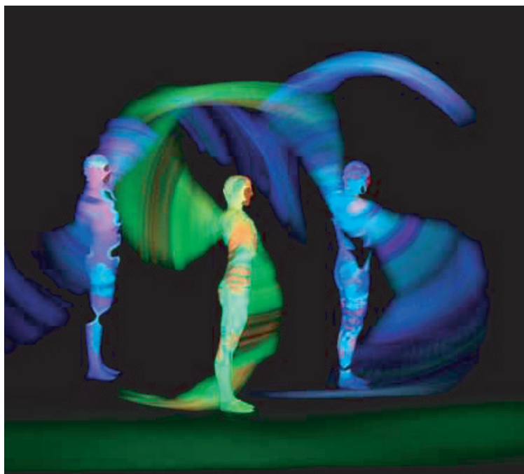
Black Light Theatre, Prague

The intense darkness of the black theatre is full of fantasy. Poetic pictures approach you from the mysterious and almost indefinite depth of a black cabinet. Music will bring inanimate to life, tragic will change into comic, unbelievable will become real. Moreover, your imagination will awake fully. If you are willing to join the adventure you may find inside something you never knew existed.